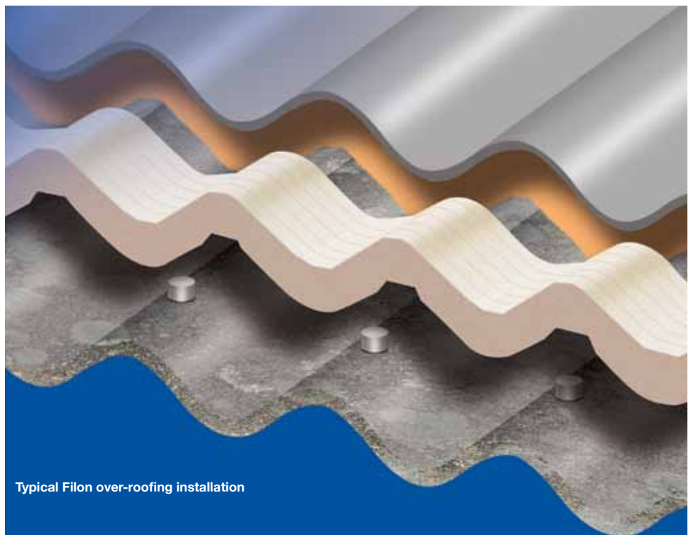
Typical Filon over-roofing installation

For further details, please call Filon Products on 01543 687300. ♦