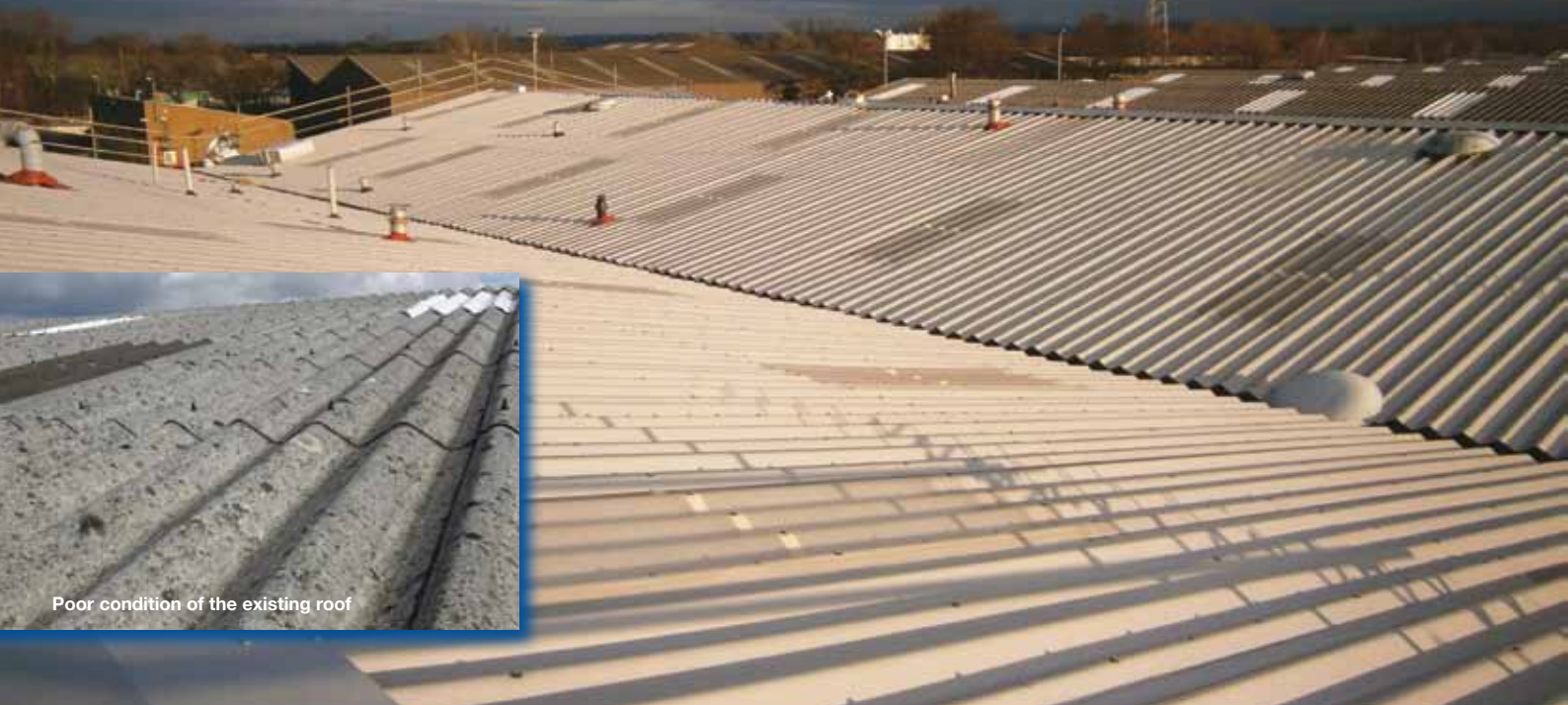
Poor condition of the existing roof

In a project undertaken by Mitie Tilley Roofing Ltd, Filon's lightweight GRP over-roofing system has been used to refurbish South Ribble Borough Council's Moss Side depot in Leyland, Lancashire.