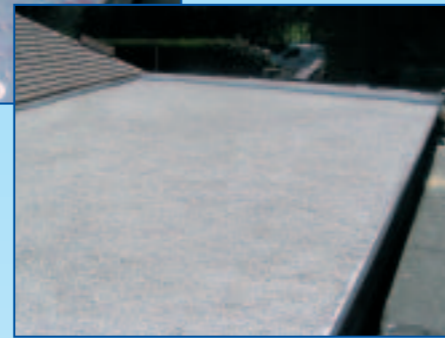
The finished roof - excellent aesthetics and effective performance with a 25 year guarantee