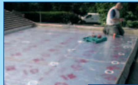
Before the GRP TecnaFlex sheets are applied, the insulation layer and MAP (Mobile Anchor Plate) fixings are visible.

The client was delighted and expressed his satisfaction with the professionalism of the contractor as well as the high quality appearance of the roof.