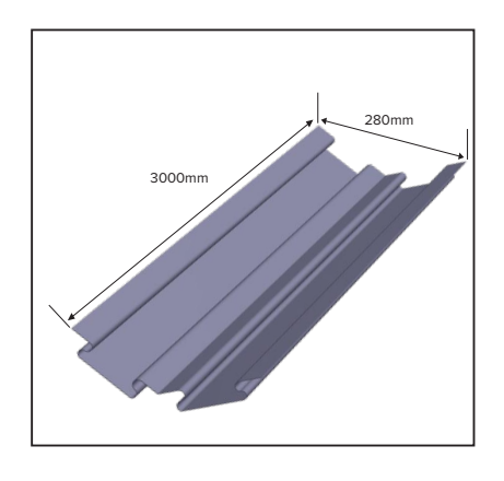
GDFHVT1 Heritage Valley Trough Slate or shallow tile application